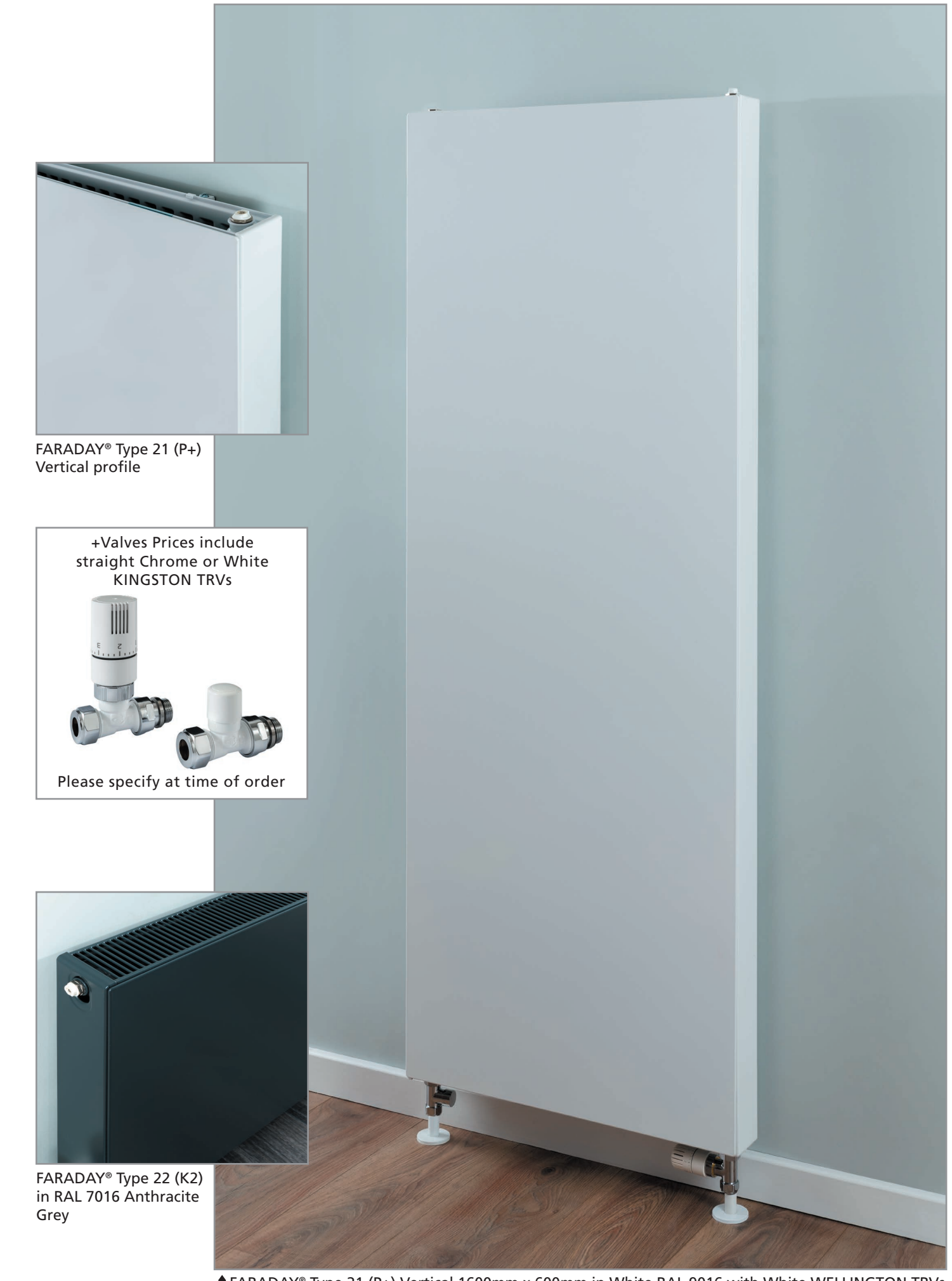
♦ FARADAY® Type 21 (P+) Vertical 1600mm x 600mm in White RAL 9016 with White WELLINGTON TRVs.

® FARADAY is a registered trademark of IRSAP UK Limited.