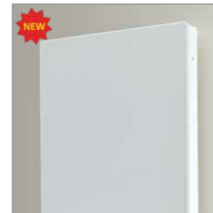
Also available in Type 21 (P+) Vertical (p.20-21).

+Valves Prices include Chrome or White KINGSTON TRV's in angled or straight.