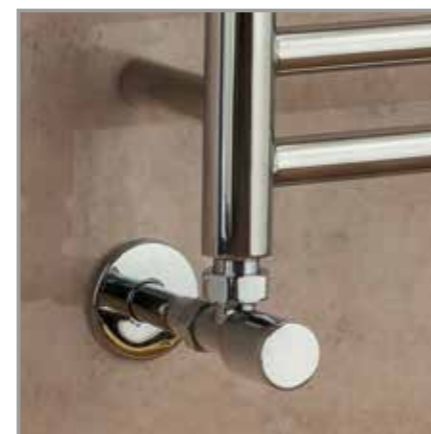
LANARK with DRAKE Valves