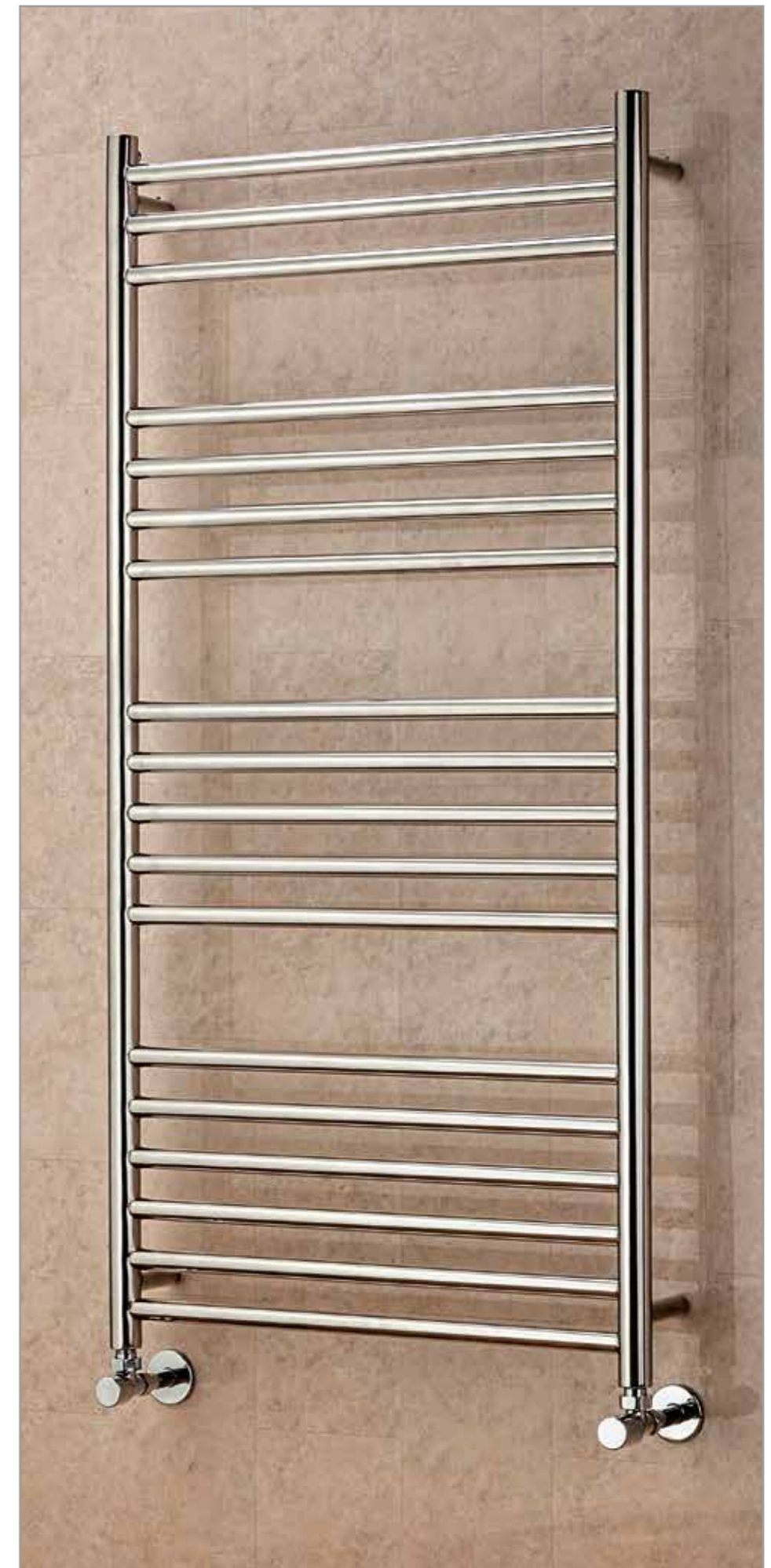
◆LANARK Straight 1200mm x 500mm shown with DRAKE Valves.