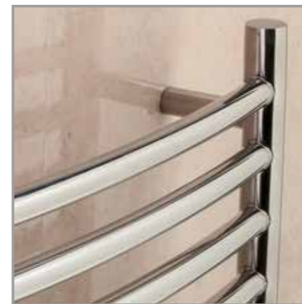
LANARK Curved option.