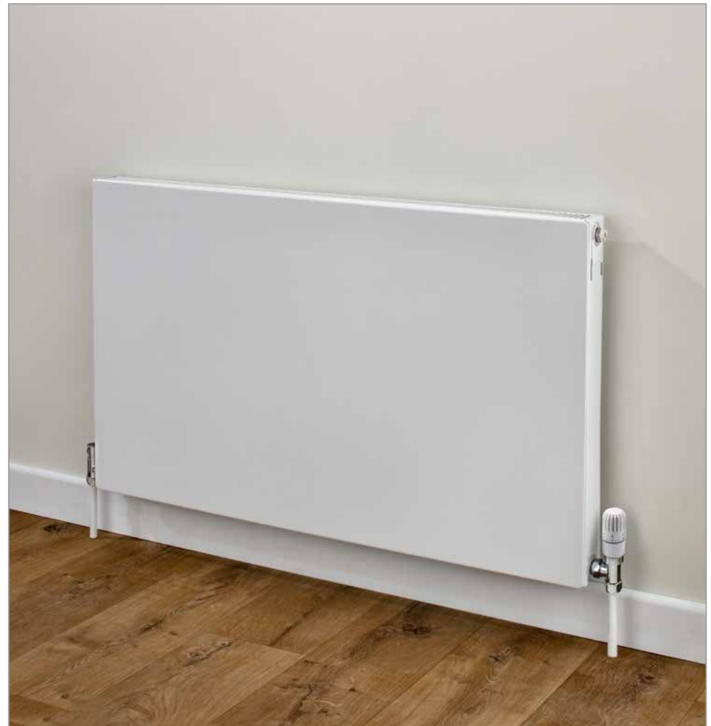
♦ FARADAY® Type 11 (K1) Horizontal 500mm x 1000mm in White RAL 9016 shown with WELLINGTON TRV's and White Radsnaps.

© FARADAY is a registered trademark of IRSAP UK Limited