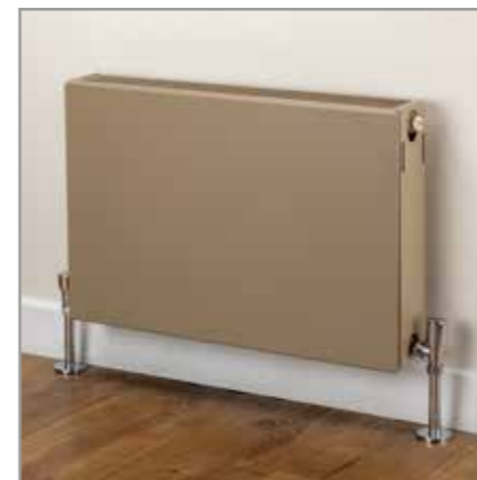
FARADAY TYPE 22 (K2) in RAL 1001.