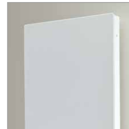
Also available in Type 21 (P+) Vertical (p.18-19).

+Valves Prices include Chrome or White KINGSTON TRV's in angled or straight.