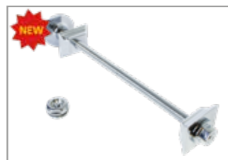
Chrome Wall Tie & Airvent