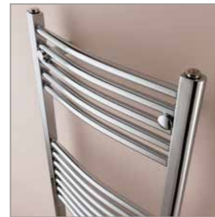
ARGYLL Curved option.

**Valves Prices include Chrome DRAKE Valves, please specify angled or straight at time of order. The ARGYLL is suitable for use as dual fuel, please see page 75 for available Electric Elements.