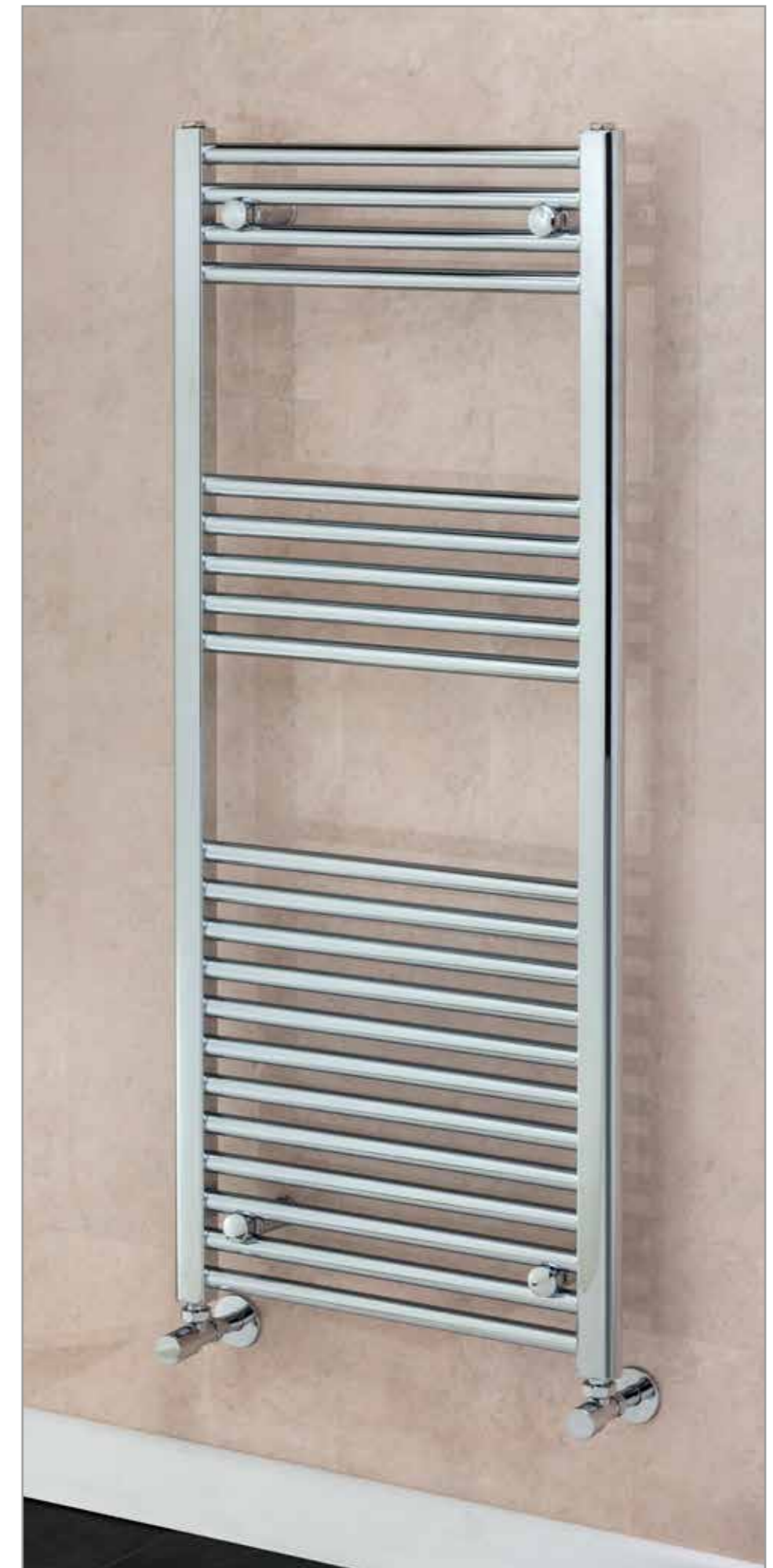
◆ARGYLL Straight 1200mm x 400mm shown with DRAKE Valves.