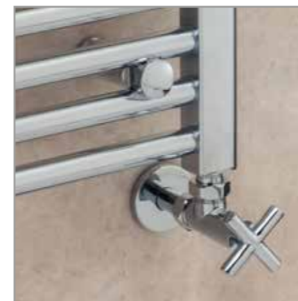
ARGYLL shown with LIVINGSTONE Valves.