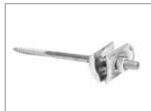
Steel Wall Tie