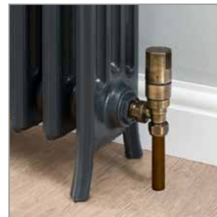
KINGSTON TRV's from £72.00 (p.71).