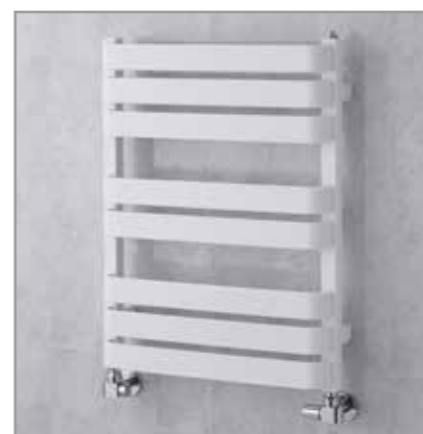
MILTON Towel Rail 655 x 500