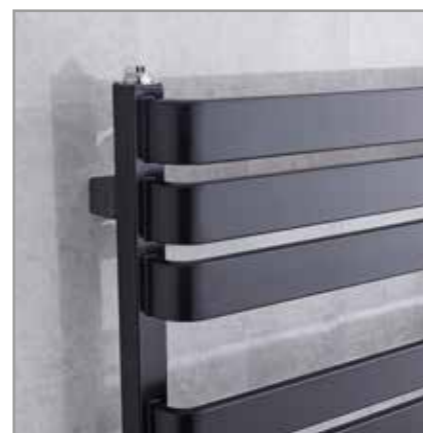
MILTON Towel Rail in RAL 9005.