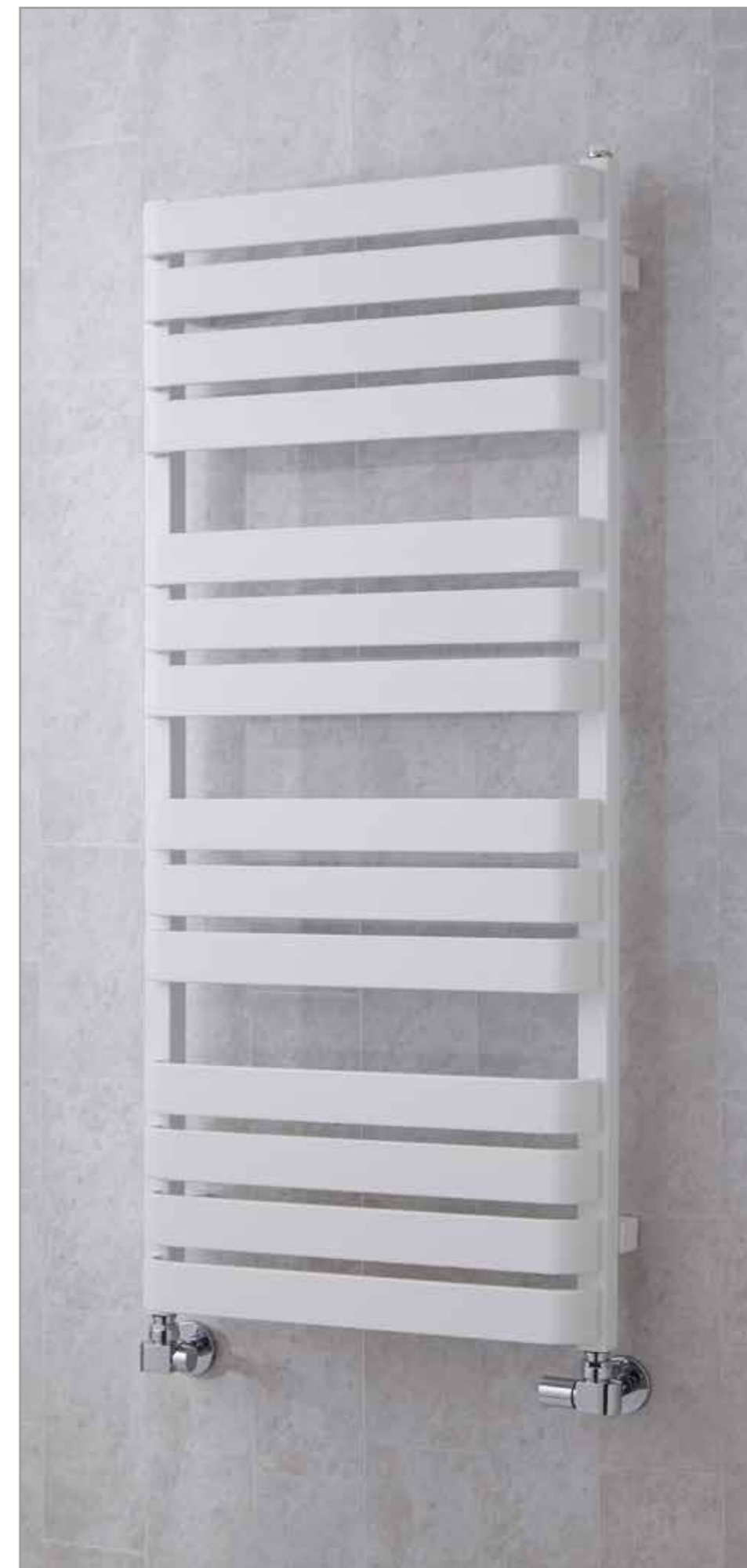
♦ MILTON Towel Rail 1110mm x 500mm in RAL 9016 shown with DARWIN Valves.

25 RAL colours available; delivery in up to 15 working days, see page 5 for more information.