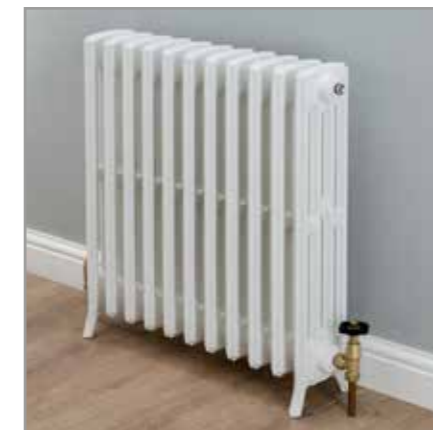
WESSEX shown in RAL 9010.

+Valves Prices include Chrome or Brass SHIRE TRV's in angled or straight.