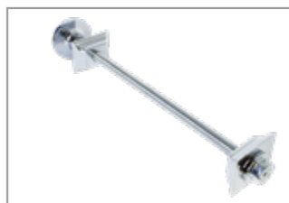
Luxury Chrome Wall Tie (see page 71 for matching airvent & blanking plug)