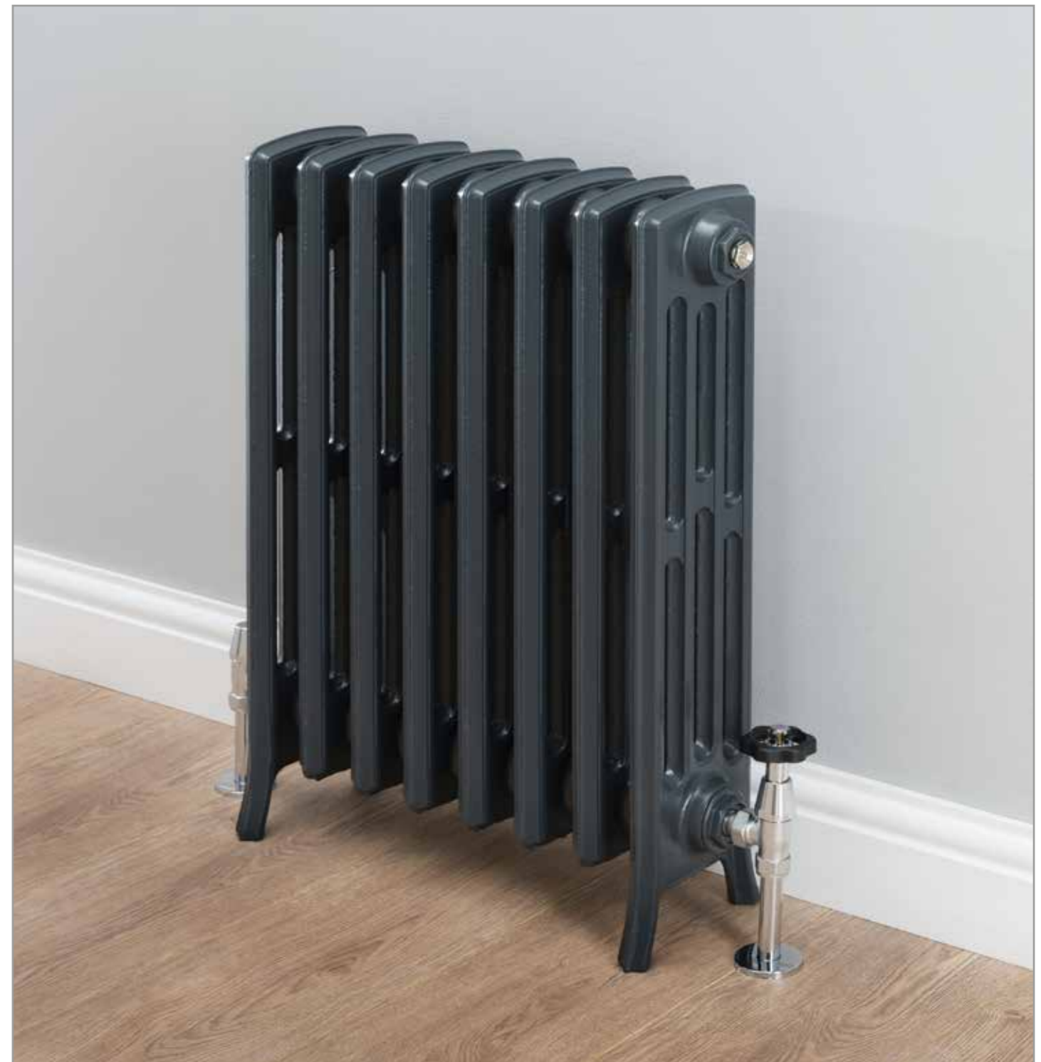
◆WESSEX 4 Column, 660mm x 508mm with Footed End Section shown in RAL 7016 with Chrome SHIRE TRV's

Pipe centres left to right = Width of radiator plus valves Pipe centres from wall = 105mm - 120mm