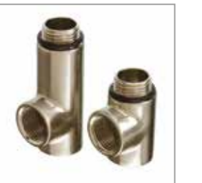
Brushed Nickel 75mm & 50mm