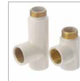
White 75mm & 50mm

50mm and 75mm T-Pieces are available as an optional extra, choose a 75mm T-Piece if you require additional length to match your pipe centres or you would like a different aesthetic finish.