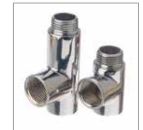
Chrome 75mm & 50mm