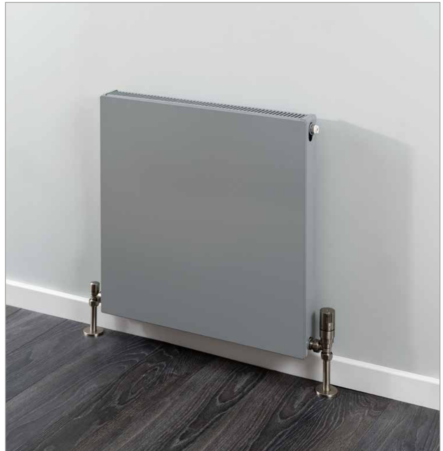
◆ FARADAY® Type 21 (P+) 600 x 600mm in RAL 7042 shown with Nickel KINGSTON TRV's & matching Pipe Covers & Shrouds.

*+Valves Prices include Chrome or White KINGSTON TRV's, please specify colour and angled or straight at time of order.