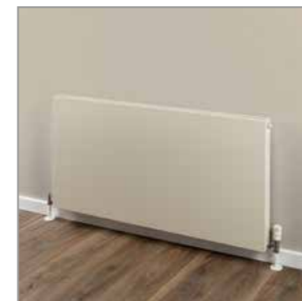
FARADAY Type 21 (P+) in RAL 1013.

+Valves Prices include Chrome or White KINGSTON TRV's in angled or straight.