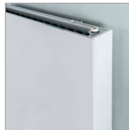
New vertical sizes for Type 21 (P+) (p.18-19).

Please note: Due to printing processes & manufacturing tolerances the colour of finished radiators may vary from the colours represented in this brochure.