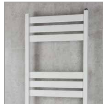
Shown in Standard White RAL 9016.