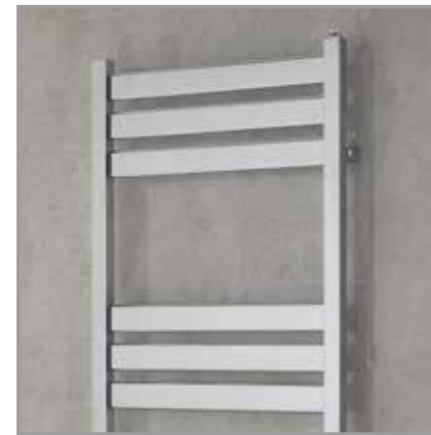
ASHBY shown in Chrome.