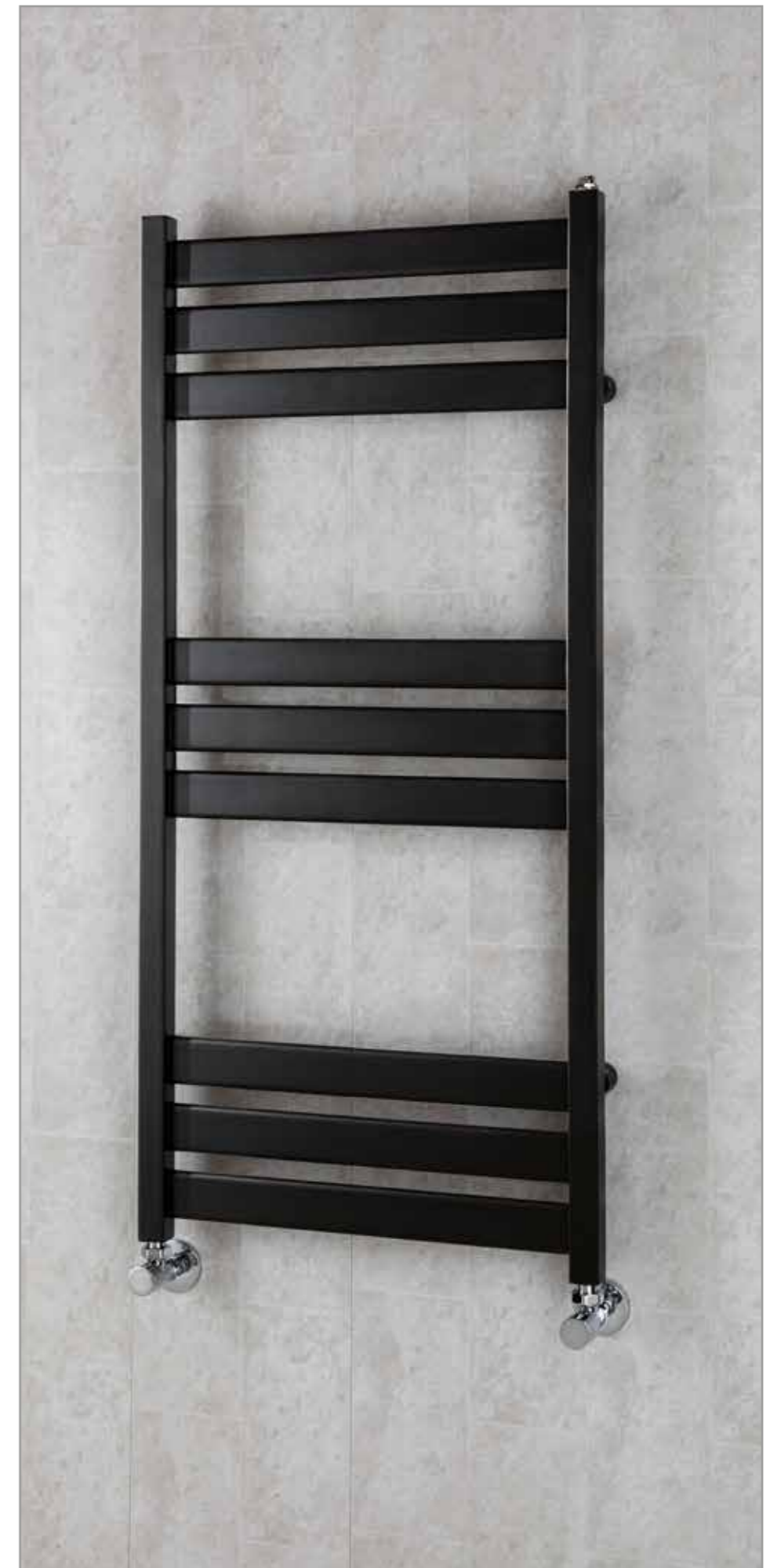
◆ASHBY 1080mm x 500mm in RAL 9005 shown with DRAKE Valves.