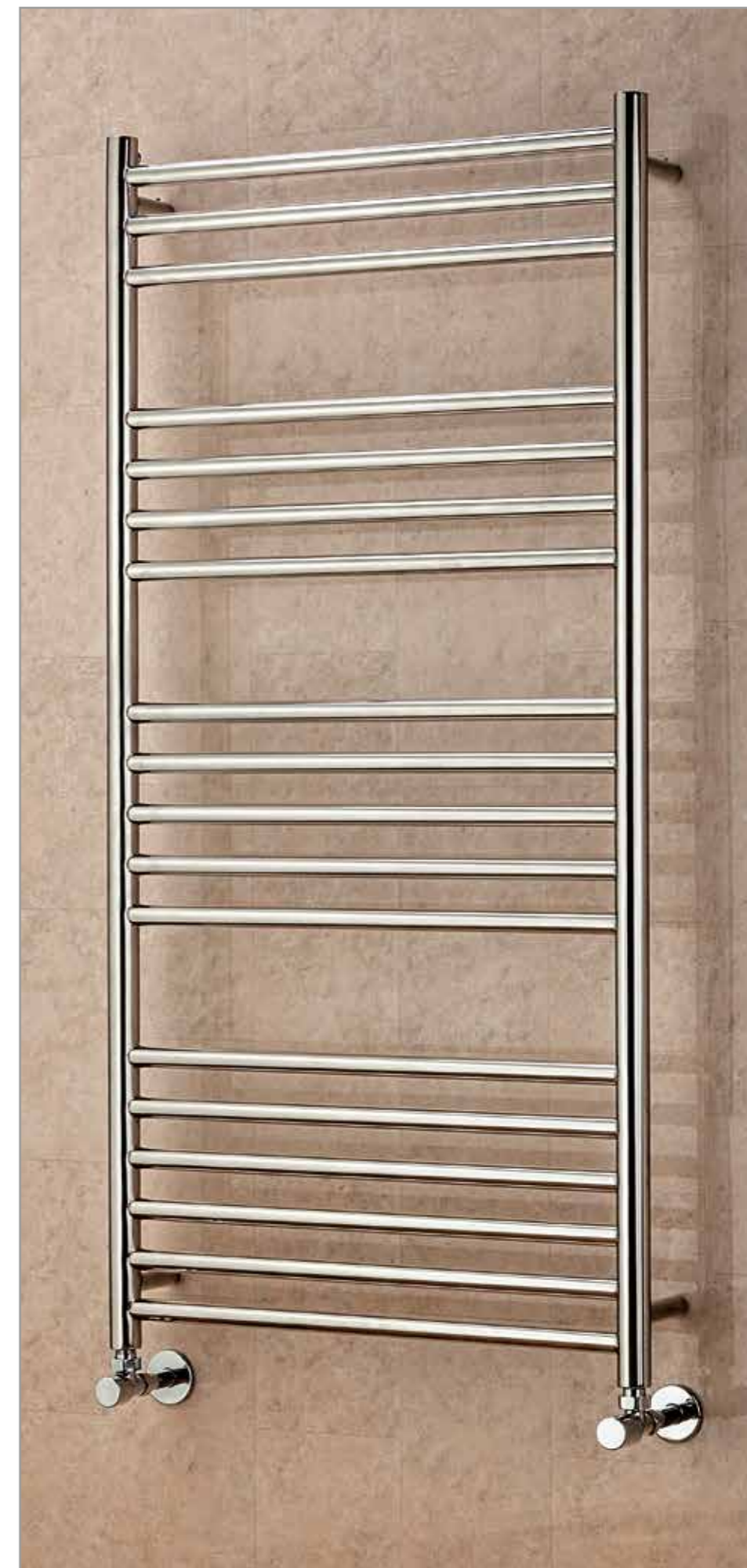
◆LANARK Straight 1200mm x 500mm shown with DRAKE Valves.